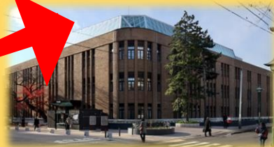
AIMR Main Building