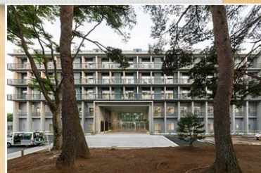
Materials Science and Engineering Education and Research Building (B01)

Contact to : Makoto Kohda (makoto[at]material.tohoku.ac.jp)