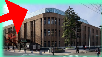
AIMR Main Building