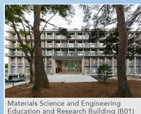
Materials Science and Engineering Education and Research Building (B01)