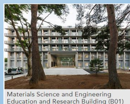
Materials Science and Engineering Education and Research Building (B01)