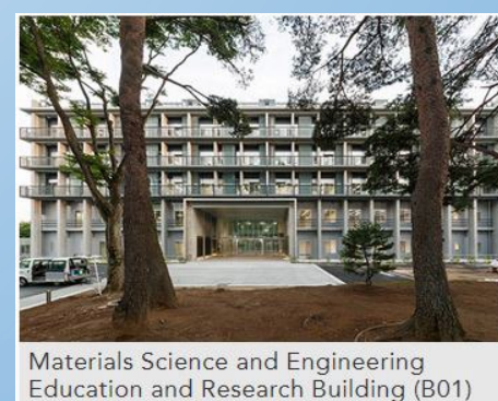
Materials Science and Engineering Education and Research Building (B01)

Contact: Makoto Kohda (makoto[at]material.tohoku.ac.jp)